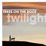
digital single: 12.02.2021