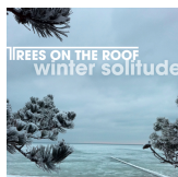
digital single: 11.12.2020

The album `Music Without Movies` strives for completion, heralded by the first release `Winter Solitude` as a digital single. With the magical spirit of Christmas arising from the modulating melancholy broken chords, it ends with a quote from the traditional carol `Sleep, Sleep, Sleep, My Precious Baby Sleep`.