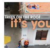
digital single: 02.04.2021